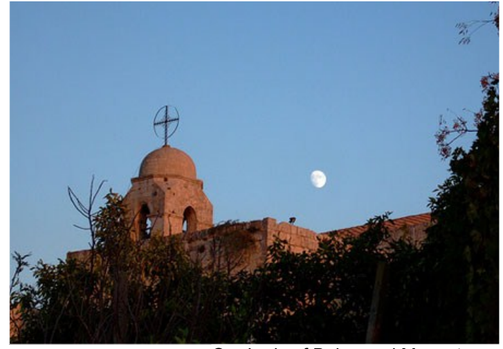
Our Lady of Balamand Monastery

In 2009 I commenced my academic career as Assistant Professor at the University of Balamand, in north Lebanon. Established by the Greek Orthodox Patriarch of Antioch in 1988, during the height of the Lebanese Civil War, the university promotes itself as a secular institution, open to students and staff from different religious backgrounds. The university arose from the still active Dayr al-Balmand (the Balamand